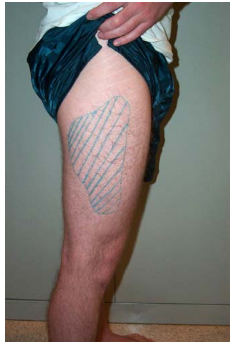
Sensory Distribution of the lateral cutaneous nerve of thigh